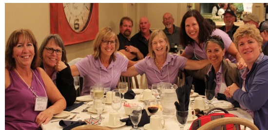
Our volunteer team We couldn't do it without you!