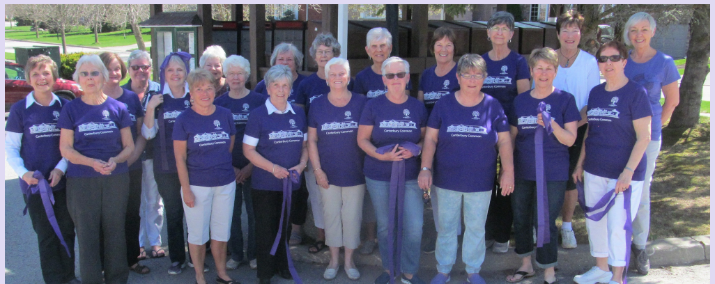
Some of the many volunteers who sold purple ribbons door to door for the Tie One On Campaign