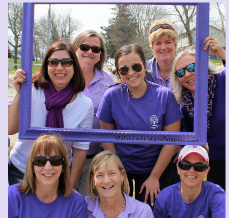
ORH Volunteers, always smiling