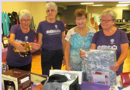
Canterbury ladies check out many items to be auctioned at the Loonie Auction.