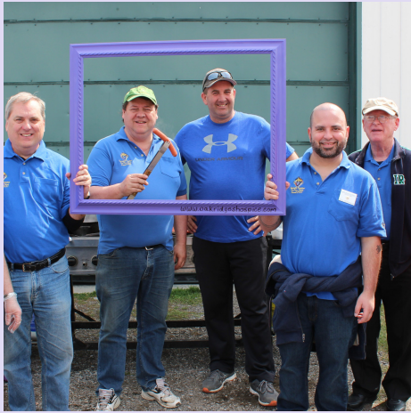
Our BBQ Boys, The Knights of Columbus