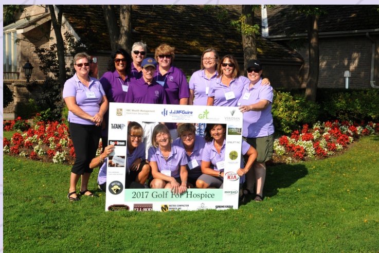
Our intrepid team of committed volunteers helped make the day a tremendous success. Note our special guest, jockey Sandy Hawley, middle and center!