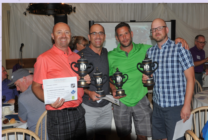
The winning team from Metro Compactor and our Platinum Sponsor. Congratulations gentlemen!

Most importantly, the tournament raised over $134,000!